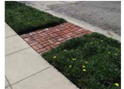
Examples of Drought Tolerant Landscaping