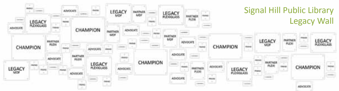
Signal Hill Public Library Legacy Wall

The Signal Hill Public Library Legacy Wall is another great way to support the Library, while recognizing, celebrating or commemorating a special person in your life or our community. Acrylic tiles will be beautifully engraved with names and be mounted among others in a stunning display that will adorn the entryway of the new Library. Gift levels start at $1,000. To see all gift options for the Legacy Wall, visit www.cityofsignalhill/librarycampaign . For more information, you can also call 562-989-7330 or visit the 3rd floor of City Hall, located at 2175 Cherry Avenue.