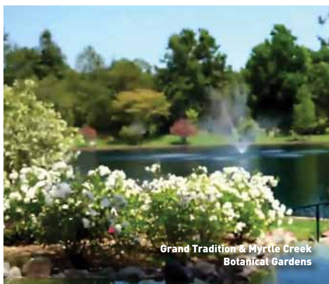
Grand Tradition & Myrtle Creek Botanical Gardens

Enjoy a beautiful docent-guided tour of the Grand Tradition with breathtaking views of the estate and its heart-shaped lake. Then, travel over to Myrtle Creek Botanical Gardens & Nursery for a unique experience! Explore the butterfly gardens, wild bird sanctuary, and the historic Fallbrook Barn. After lunch, enjoy a slice of pie on us!