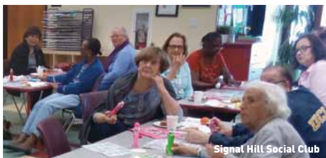
Signal Hill Social Club

Bring your friends for a morning of BINGO and prizes at the Signal Hill Library during this special time just for active adults ages 55 and older. Enjoy time to socialize, play games, get help with the computers or spend time browsing books. BINGO is free to play and all are welcome. Coffee and light refreshments will be provided.