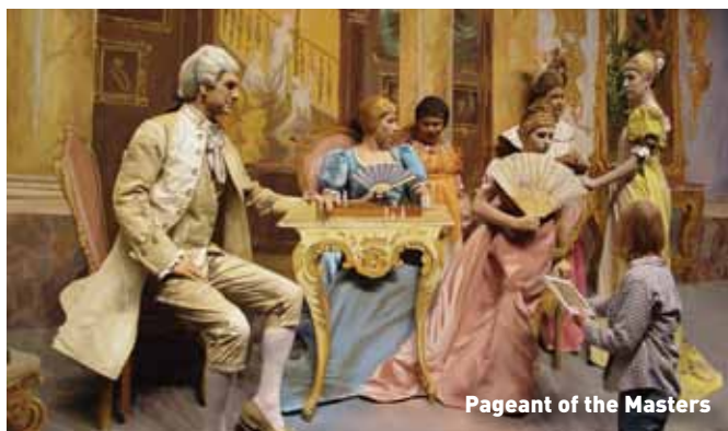
Pageant of the Masters