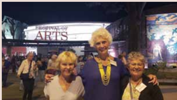
Enjoying the Pageant of the Masters in August

The California Avocado Festival is one of the largest festivals on the West Coast. The festival hosts over 75 musical guests, a children's venue, arts & crafts booths, plenty of fun contests, and the world's largest vat of guacamole. Upon arrival, guests will have about four hours on their own to explore this incredible festival. Don't miss out!