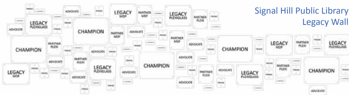
Signal Hill Public Library Legacy Wall

For more information on gift options for Naming Opportunities and the Legacy Wall, call 562-989-7330 or visit www.cityofsignalhill.org/librarycampaign .