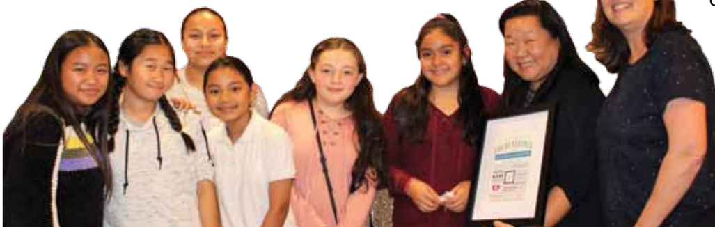
Jessie Nelson Middle School Interact Club

The Jessie Nelson Middle School Interact Club continues to give volunteer support throughout the year to many City programs, services and activities. This past year, the Interact Club focused on introducing teens and young adults to the benefits of volunteering and community service. This group of young people assisted with special events such as the 2018 Mayor's Clean-Ups, 2018 Senior Valentine's Luncheon, Spring Fest, Hounds on the Hill, and Halloween Carnival.